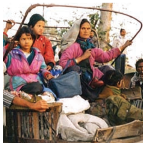
NEPALI MIGRANTS ON THE WAY TO INDIA

For further details please e-mail recruitment@world.inf.org