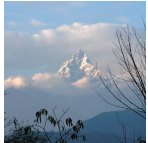
MACHHAPUCHHRE – THE MOUNTAIN THAT INSPIRED THE INF LOGO

INF Nepal is the biggest member of the family and is a national non-government organisation which implements a range of health and development programmes in western Nepal. It has a staff of about 320 Nepalis and 20 expatriate volunteers. It works in TB and leprosy control, community health and development, hospital and rehabilitation services for people with disabilities, drug awareness / rehabilitation and HIV / AIDS education, counselling and care. INF is governed by a board of Nepali Christian leaders and led by a Nepali Executive Director.