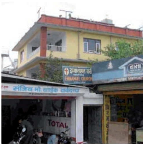
RETURNEES' DROP-IN CENTRE IN KATHMANDU