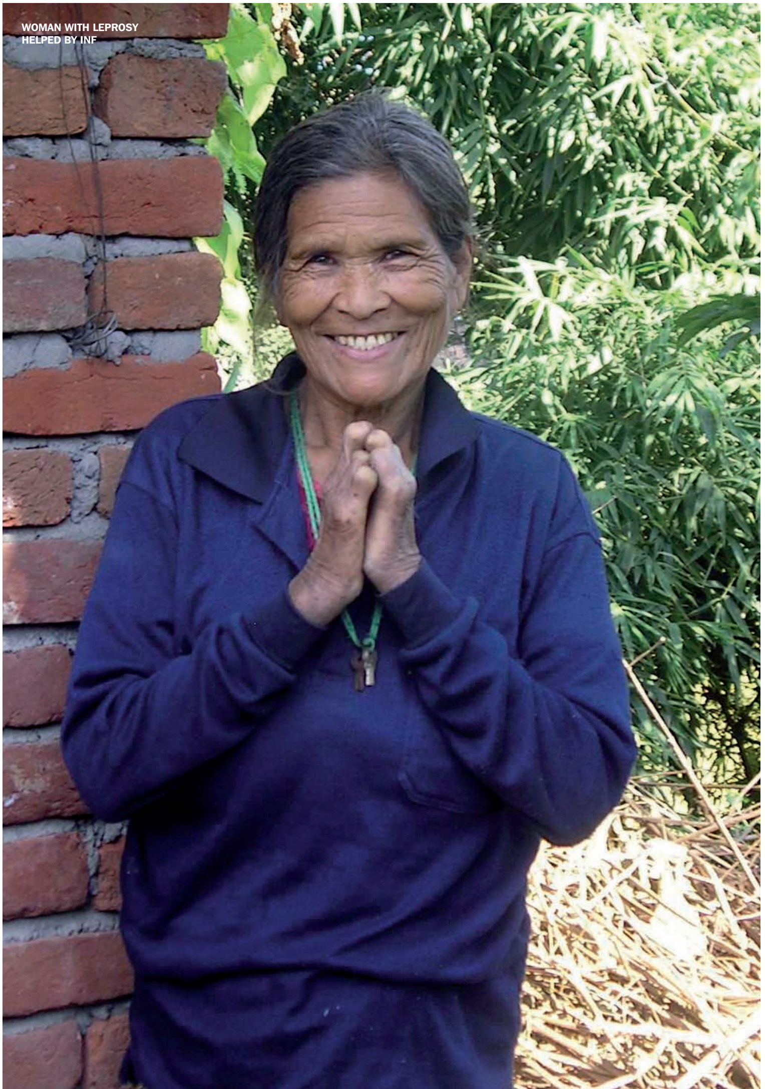
WOMAN WITH LEPROSY HELPED BY INF