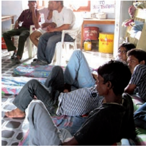
DROP-IN CENTRE FOR DRUG ADDICTS IN NEPALGUNJ