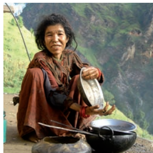
MUGU: LIVING ON THE EDGE