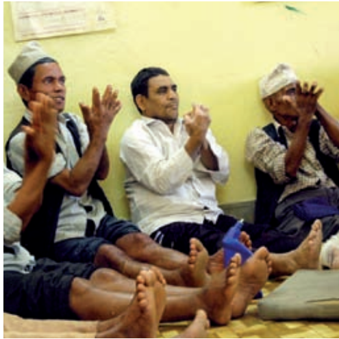
LEPROSY PATIENTS IN SURKHET