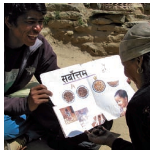
INF STAFF MEMBER ON A NUTRITION FOLLOW-UP VISIT WITH A MOTHER IN JUMLA