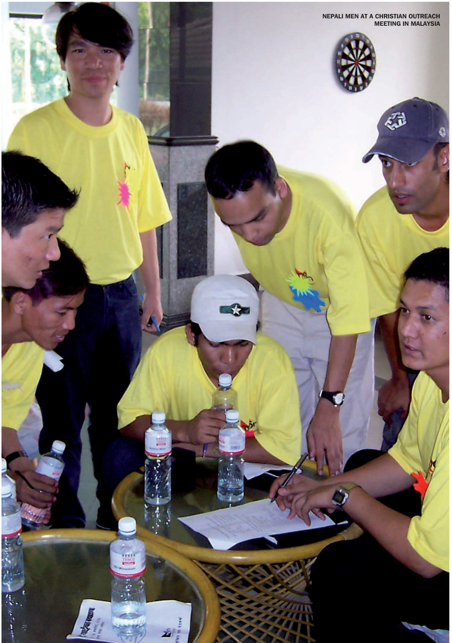
NEPALI MEN AT A CHRISTIAN OUTREACH MEETING IN MALAYSIA