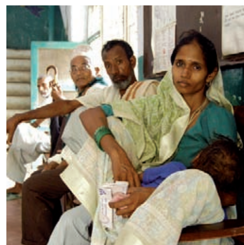
TB OUTPATIENTS IN INF'S BANKE TB CENTRE

INF Programmes are supported by INF Nepal's Central Office, which is located in Pokhara [Kaski District] and Nepalgunj [Banke District] and provides essential organisational services such as Finance, Personnel, Administration, the Director's Department, Donor Advice, Security, Technical Advice and Programme Co-ordination. The costs of the Central Office are mostly met from a small administration charge on Programmes [approximately 6.5%].