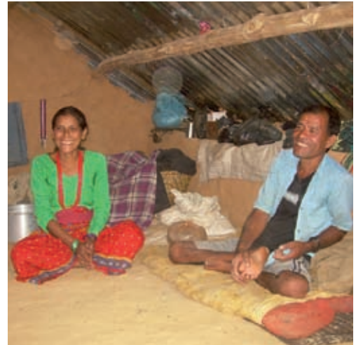
INF CLIENTS FROM DAILEKH

Expatriate staff needs: A full up-to-date list of all expatriate staff vacancies is available on request from the INF Worldwide Recruitment Officer at recruitment@world.inf.org and on our web site at www.inf.org/jobs