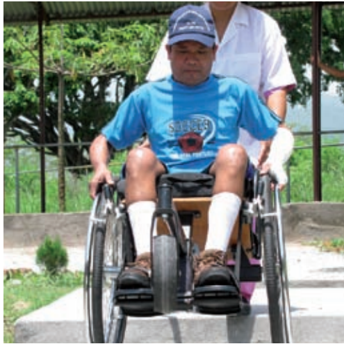
WHEELCHAIR PRACTICE AT GREEN PASTURES