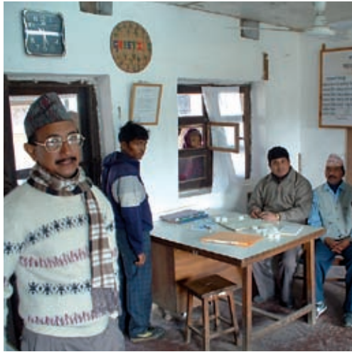
CLINIC IN DANG