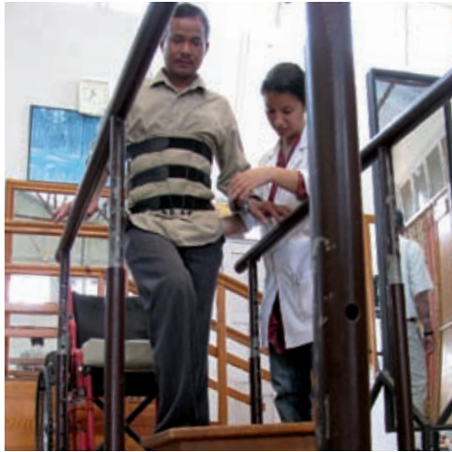
SPINAL CORD INJURY CLIENT AT INF'S GREEN PASTURES HOSPITAL AND REHABILITATION CENTRE

INF Worldwide finds, trains and supports expatriate volunteers to work with INF Nepal and several other partner organisations. It has a vision to develop in two new areas: