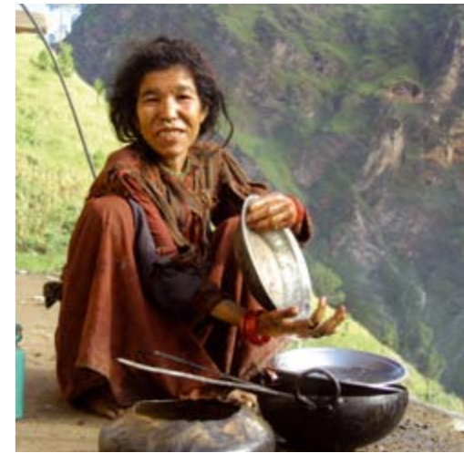
MUGU: LIVING ON THE EDGE