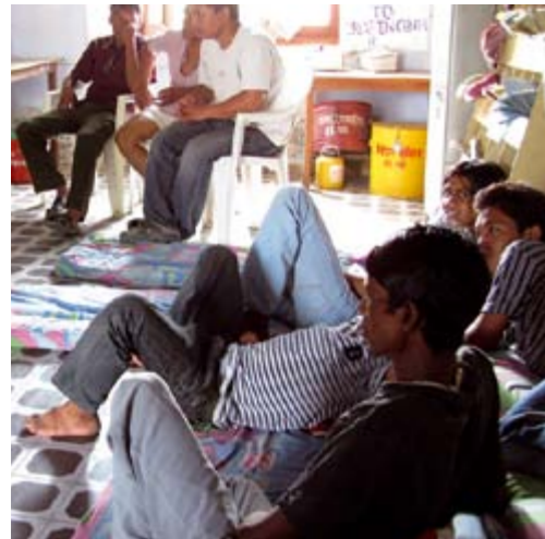
DROP-IN CENTRE FOR DRUG ADDICTS IN NEPALGUNJ