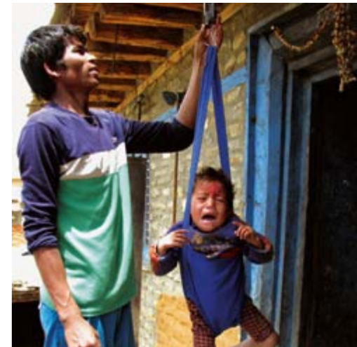
INF STAFF MEMBER WEIGHING A MALNOURISHED CHILD IN JUMLA