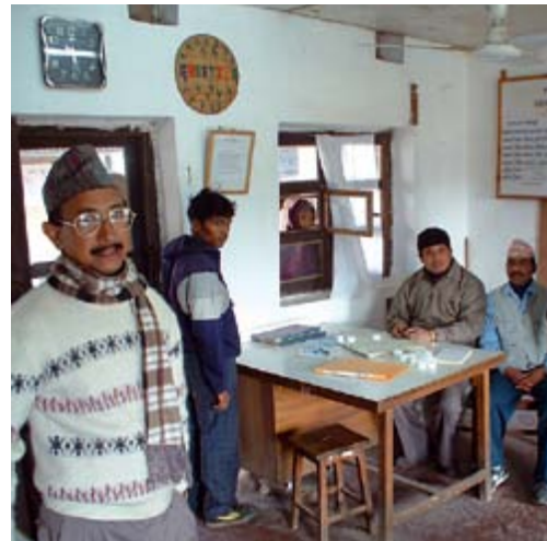
CLINIC IN DANG