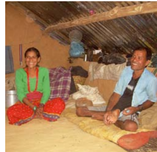
INF CLIENTS FROM DAILEKH

Expatriate staff needs: A full up-to-date list of all expatriate staff vacancies is available on request from the INF Worldwide Recruitment Officer at recruitment@world.inf.org and on our web site at www.inf.org/jobs