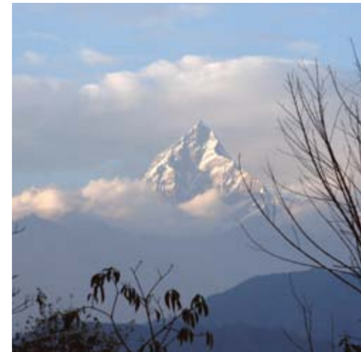
MACHHAPUCHHRE – THE MOUNTAIN THAT INSPIRED THE INF LOGO

Some 59 years later, INF is still pursuing this same historic purpose. This prospectus gives an overview of the INF family today – explaining who we are and what we do. It also highlights the major areas where we need support in order to continue our current work and take forward the new and exciting opportunities that are before us. Please read on and see how you might be able to help.