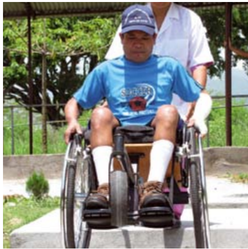
WHEELCHAIR PRACTICE AT GREEN PASTURES