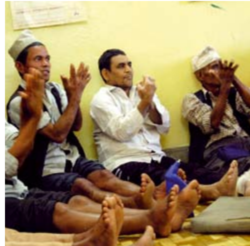
LEPROSY PATIENTS IN SURKHET