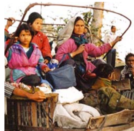
NEPALI MIGRANTS ON THE WAY TO INDIA

For further details please e-mail recruitment@world.inf.org