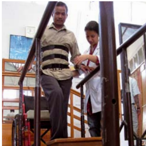
SPINAL CORD INJURY CLIENT AT INF'S GREEN PASTURES HOSPITAL AND REHABILITATION CENTRE

INF Worldwide finds, trains and supports expatriate volunteers to work with INF Nepal and several other partner organisations. It has a vision to develop in two new areas: