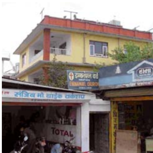
RETURNEES' DROP-IN CENTRE IN KATHMANDU