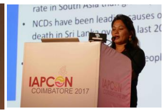
INF team members presenting, and posters with authors