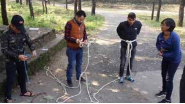
Participants learning emergecny evacution techniques