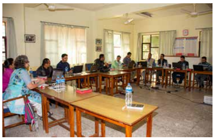
The final CDMC meeting

• Community Development Management Committee's meeting was held on 1-2 November at the Central Office. As the change process has already begun, it was the last meeting which was attended by the managers from the community development side, funding and technical areas.