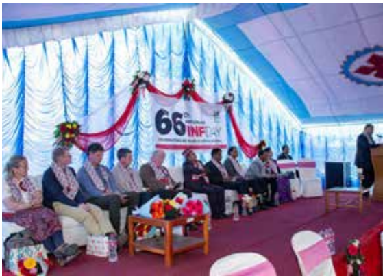
Guests during the programme