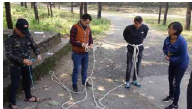
Participants learning emergency evacuation techniques