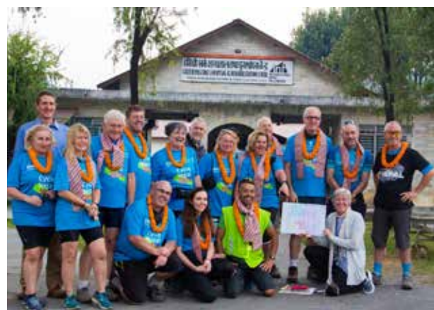
EMMS cyclists greeted at GPH