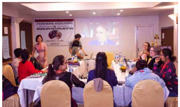
Participants from Canada, Vietnam and Nepal during the workshop