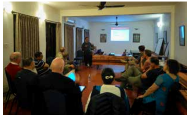
Chair and CEOs' meeting