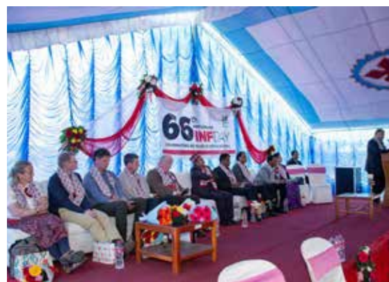
Guests during the programme