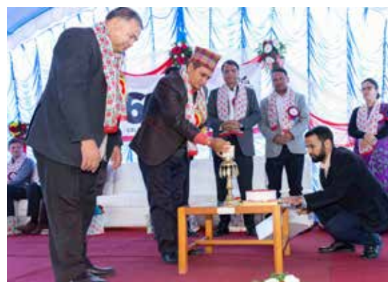
Guest of Honour inaugurating the event