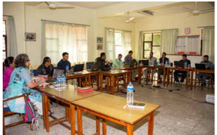
The final CDMC meeting