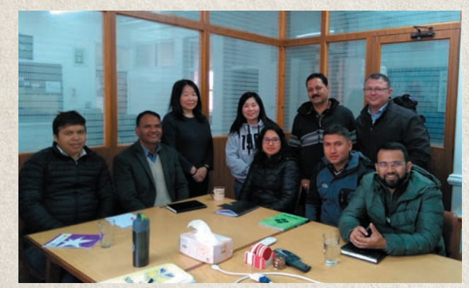
TAI team with INF team at ICO