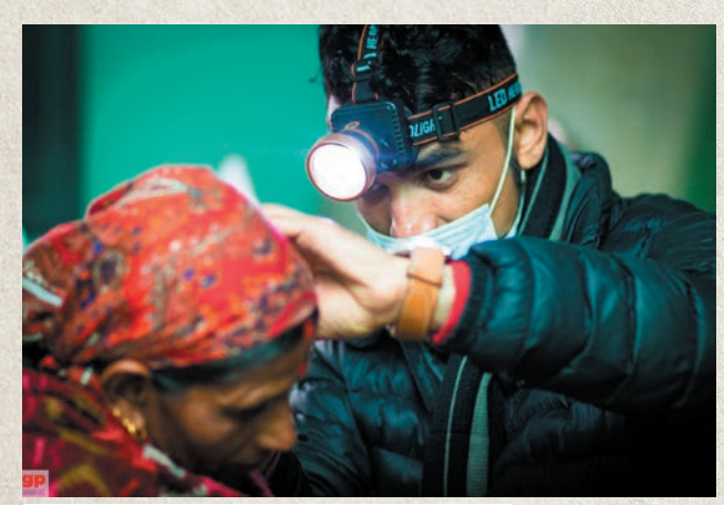
INF Doctor treating an ear patient