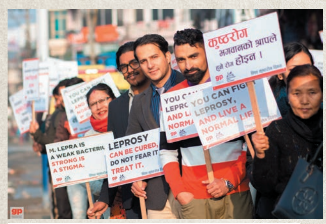
Participants holding placards during the rally