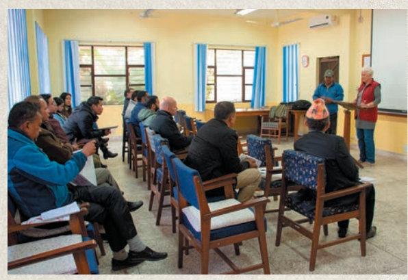
Participants during the presentation