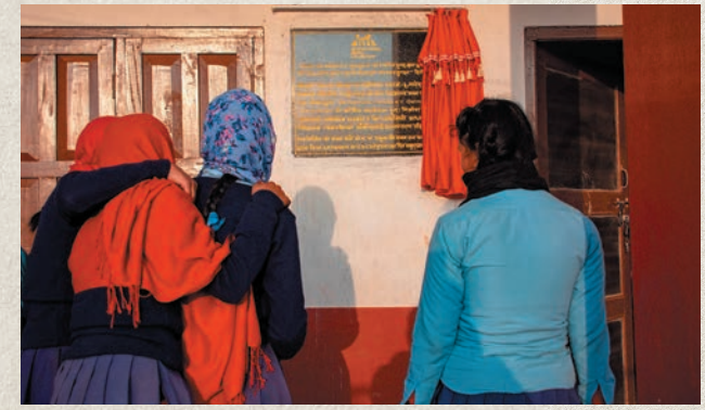
School girls eagerly reading the marble inscription placed on the wall