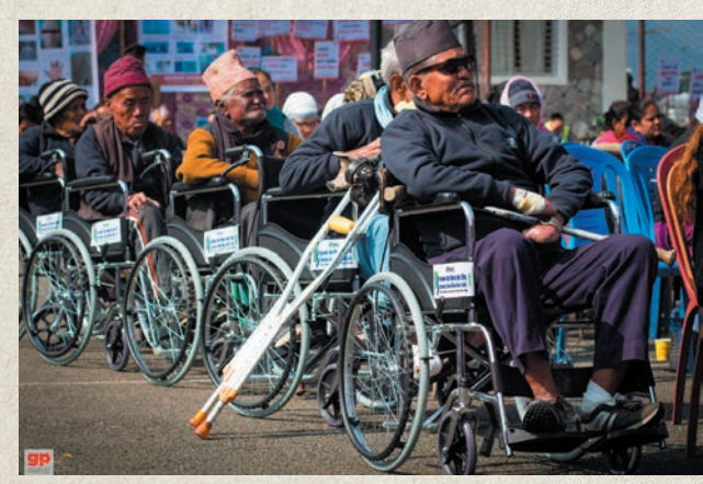
Leprosy patients on wheelchairs listening carefully