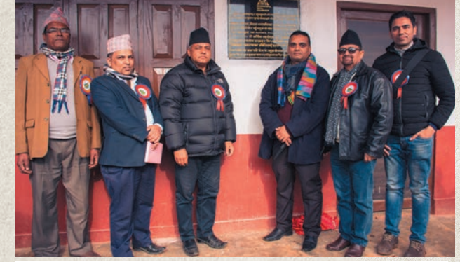
Government officials and INF staff after formally inaugurating and handing over of a school posing for a group photo