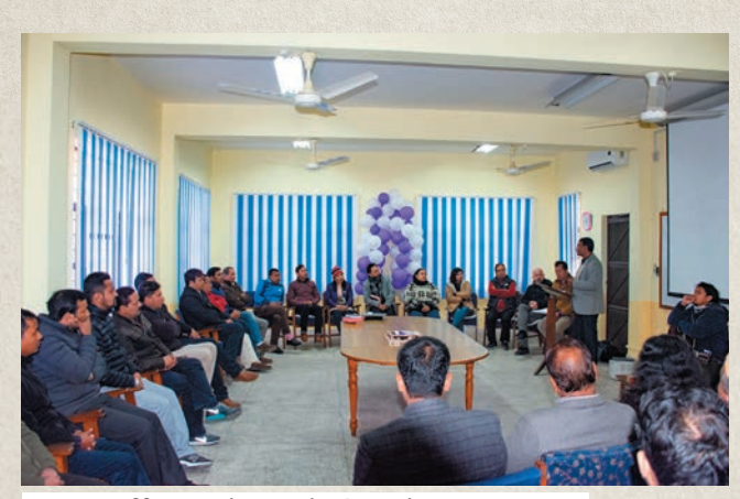
INF staff members during the New Year Celebration programme at ICO

• With the commencement of this New year 2019, Partnership and Communications Department has started issuing the INF staffs ID card and has been printing it in-house. Printing and distribution of INF staffs ID card at the Central Office have been completed. While for the staff at other centres and Hospitals the ID card distribution is expected to be completed within March.