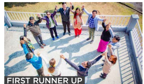
FIRST RUNNER UP