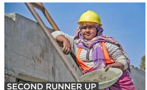
SECOND RUNNER UP