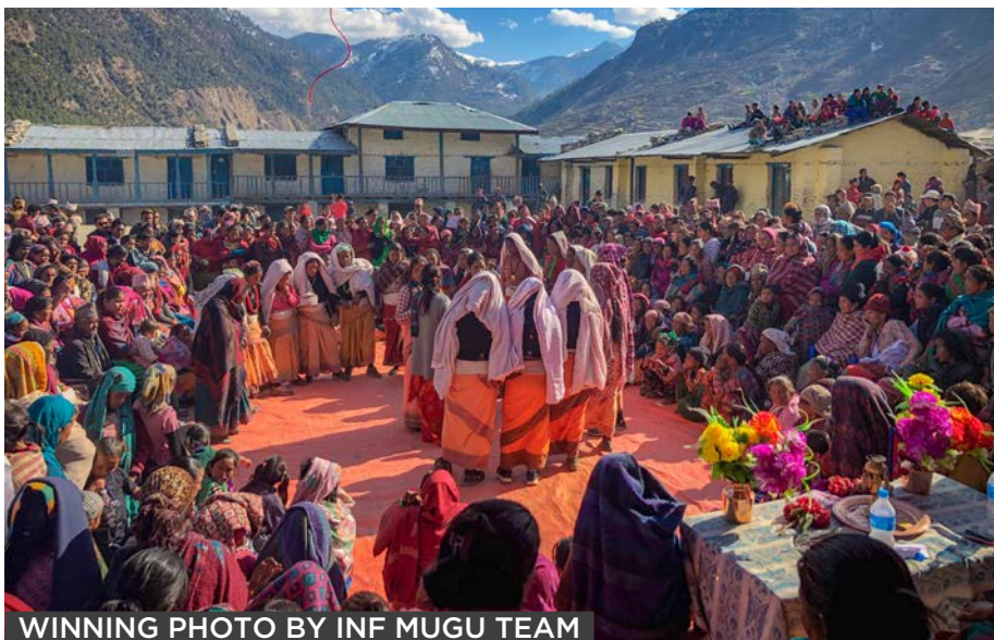
WINNING PHOTO BY INF MUGU TEAM