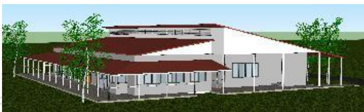
Artist Impression of future PC building above: main entrance (north-eastern side); below from western aspect

New PC staff will be added to the GPH team from this month.