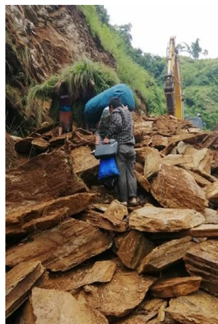
INF staffs passing through the landslide carrying training materials to Rolpa