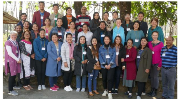
Introductory workshop: participatory communication sessions and all the participants