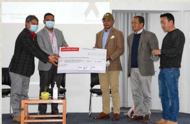
The Gurung Family