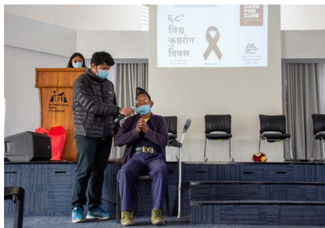
Former leprosy patient sharing his testimony