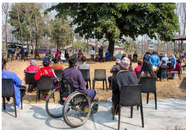
Patients and staff at the outdoor events

INF also took part in Social Media Contest organised by Sasakawa as a part of their global fundraising campaign, and end up winning the contest where two of our photo/stories have been chosen and put up on their online photo exhibition - https://gasasakawa.org/online_photo_exhibitions.php