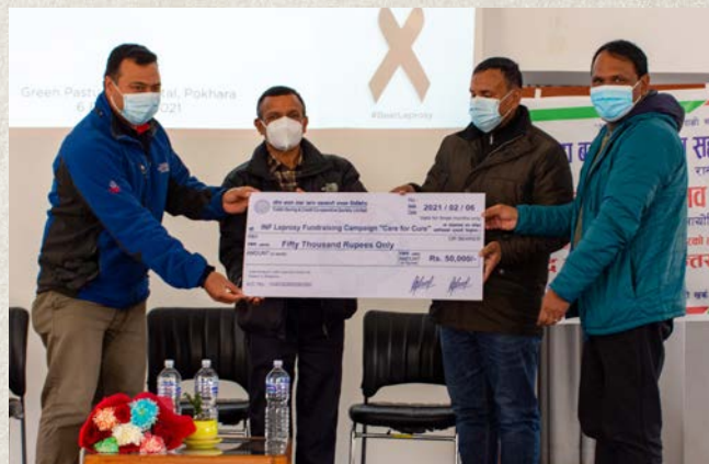
Todah Saving and Credit Cooperative