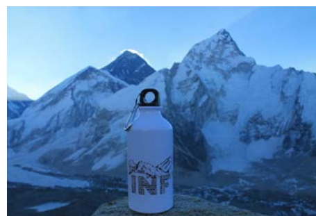
Deep's INF water bottle at the lap of Mt. Everest [8848.86 m].