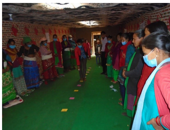
Business activities demonstration