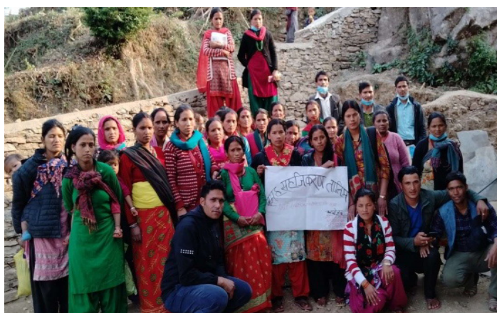
SHG facilitation training

INF Nepal Kalikot conducted two-day business creation training for the SHG members of Narharinath Rural Municipality. A total of 75 SHGs members from each SHGs participated in the training. The training was conducted to improve the financial capabilities of SHG members, especially women, for them to become financially self-reliant by helping them commence suitable income-generating activities that contribute to the economic well-being of their family and communities.