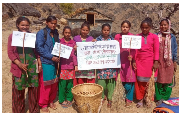
Students have started the sanitation movement in their school