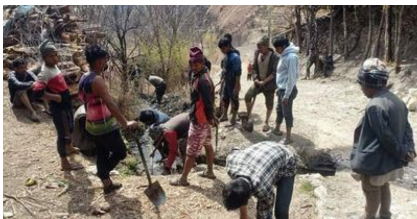
Youth club members cleaning the streets and drainage

Young people are considered a catalyst for change, as they can be the driving force for diverse social and cultural settings. INF Nepal Jumla mobilised Laganshil Youth Club in Ward No. 2 Bota of Kanakasundari RM. There are 35 members [20 male and 15 female] in the club and is actively working in the community. The Youth Club sits for its monthly meeting and discusses social issues. Through youth mobilisation, these young people learn about contemporary social and health problems like COVID-19, Chhaupadi, child marriage, polygamy and sanitation. They have been contributing significantly in raising awareness to stop social malpractices through street drama and individual counselling. This youth club also follows up and monitors the government's work and other organisations in their village. This month, the club also carried out road cleansing and sanitation activities to clean the village's environment.