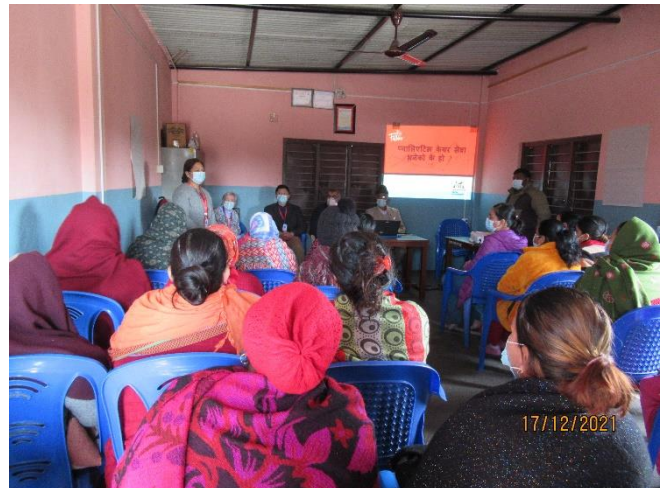
Community awareness programs run by Green Pastures team, held in local community rooms, and organized by local chairperson