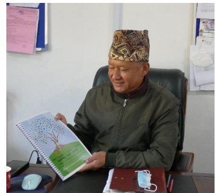
Meeting with the Mayor of Marsyangdi Gaunpalika, Lamjung District, with the opportunity to give him a copy of the draft Nepali Toolkit, and discuss future training possibilities in his area.